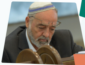
Rav Haim Sabato