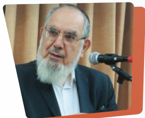
Rav Nahum Eliezer Rabinovitch

The Yeshiva is guided by a dedication to the ideals of Ahavat HaTorah, Ahavat HaAm and Ahavat HaAretz. The faculty, virtually all of whom have served in frontline units in the Israel Defense Forces, fully embody these ideals.