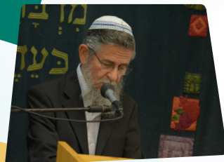
Rav Yitzhak Sheilat