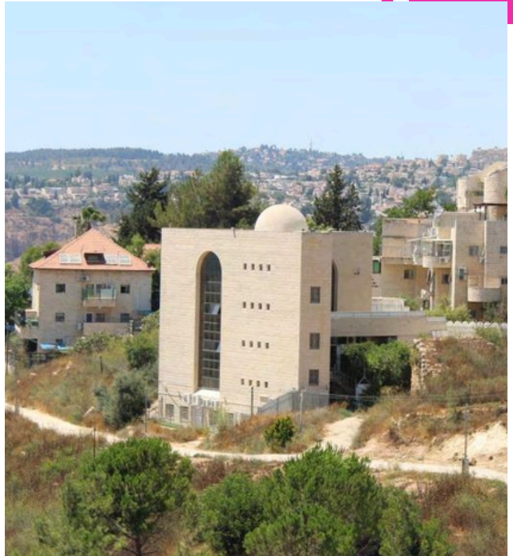
THE SCHOOL BUILDING

Each of our apartments are equipped with a dairy kitchen and a living room, along with full bathrooms and bedrooms. Our bedrooms and living rooms are air-conditioned, heated, and furnished to make your "home away from home" cozy and comfortable.