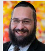
Rav Binyamin Wolf